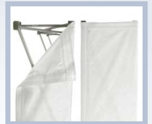
The image is attached with practical Velcro. Choose between having an image on the front or on both the front and sides.

INSTRUCTIONS – WATCH THE VIDEO AT WWW.EXPOLINC.COM