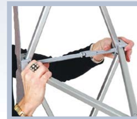
The frame locks into place quickly and easily.