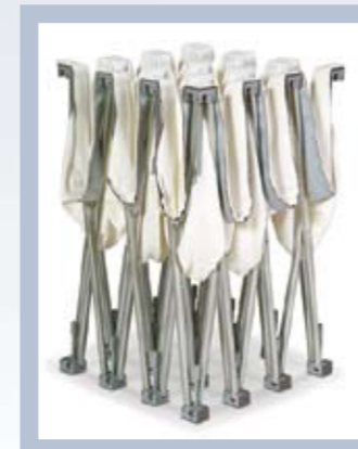
Smart all-in-one design and low weight make the system easy to carry.